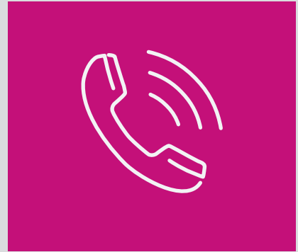
CXone Personal Connection

Seamlessly integrated Voice Portal / IVR